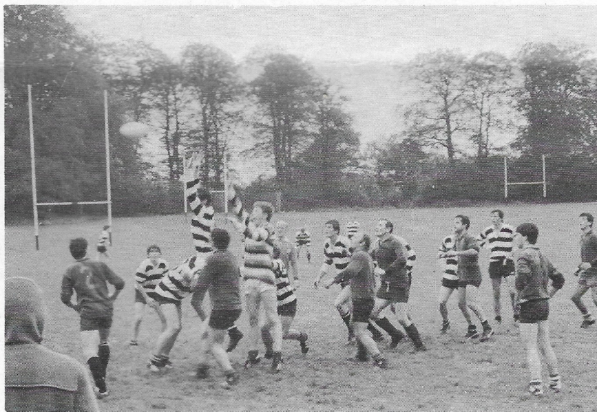
Past v. Present line out: October '83