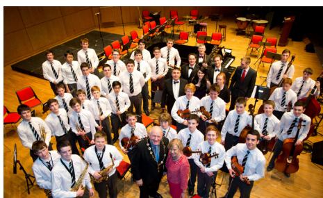
The scene from the balcony at UL Concert Hall during CCR's annual Musical Evening in 2012.