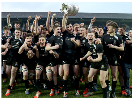
The scene as members of the victorious SCT celebrate CCR's victory over Belvedere College in the Leinster Cup Final on St. Patrick's Day 2015.