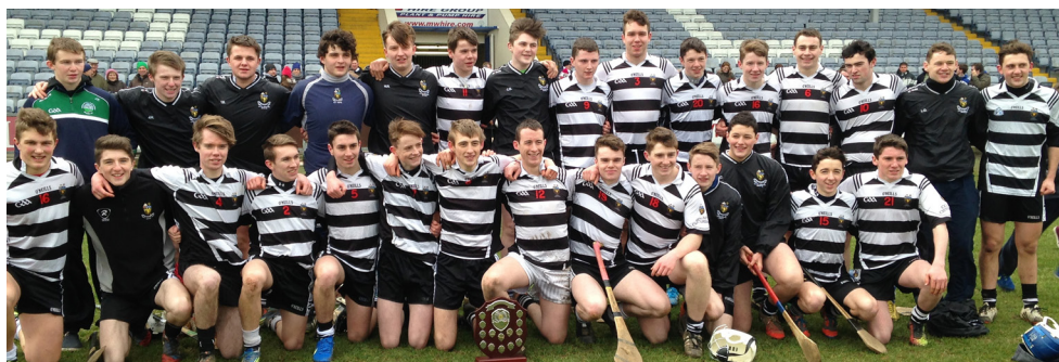
Leinster and All Ireland Hurling 'C' Champions 2015