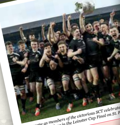
The scene as members of the victorious SCT celebrate College in the Leinster Cup Final on St. P.